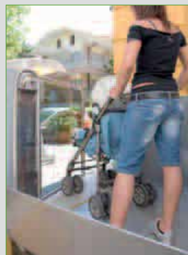
Version with the gate with crystal glass