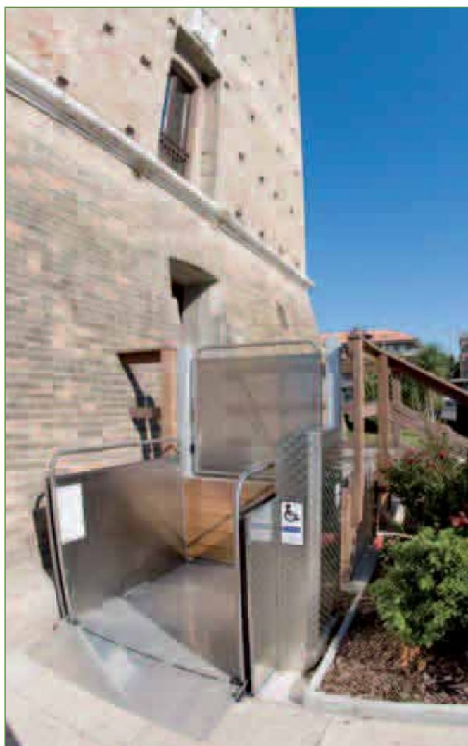
Version with the straight exit

Thanks to its electric lock, the gate is automatically opened when the platform reaches the top.