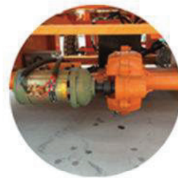
Auxiliary Propelled type