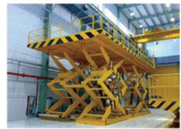
Four post type