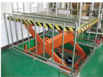
Single post type