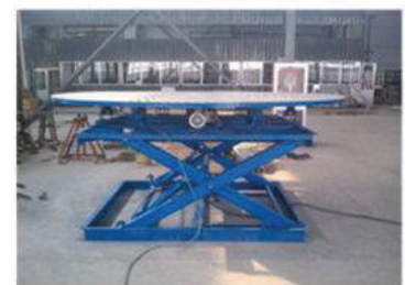
Rotation stage type