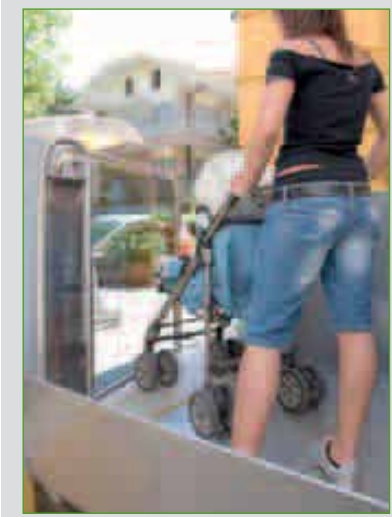
Version with the straight exit

Thanks to its electric lock, the gate is automatically opened when the platform reaches the top.