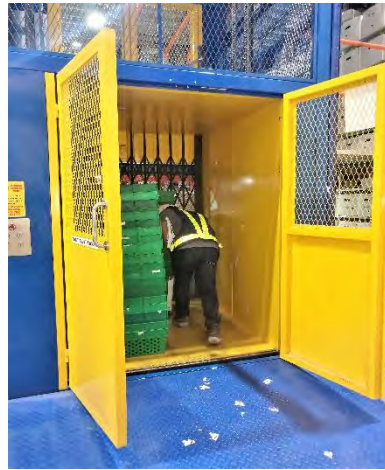
MANUAL SWING DOORS WITH TOP HALF MESH SHEETS