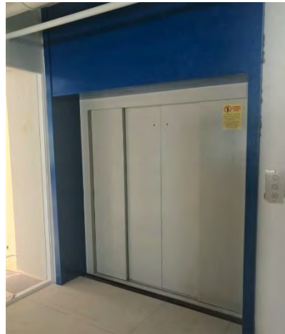
FULLY AUTOMATIC CABIN AND LANDING DOORS