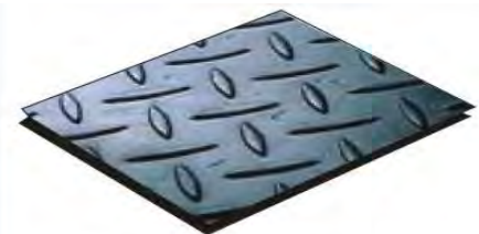
FR201 ruffled plate (standard)