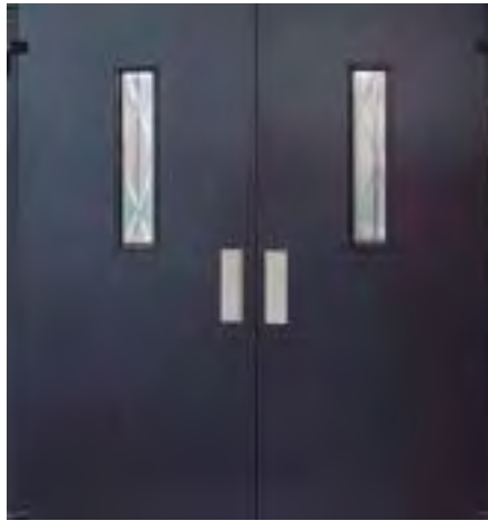
MANUAL SWING DOORS WITH VISION PANEL