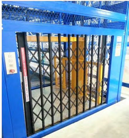
SLIDING COLLAPSIBLE DOOR FOR BOTH CABIN AND LANDING DOORS